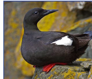
Black guillemot ( Cephus grylle )