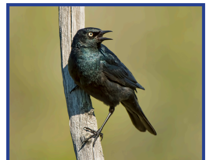
Rusty Blackbird ( Euphagus carolinus )