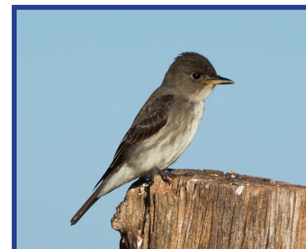
Olive-sided Flycatcher ( Contopus cooperi )