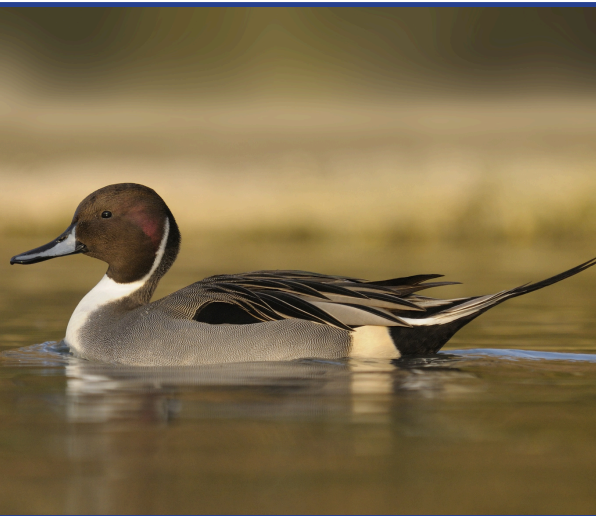
Northern Pintail ( Anas acuta )