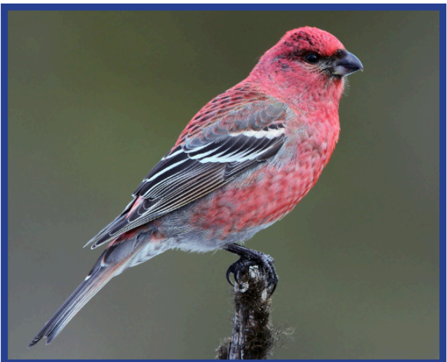
Pine Grosbeak ( Pinicola enucleator )