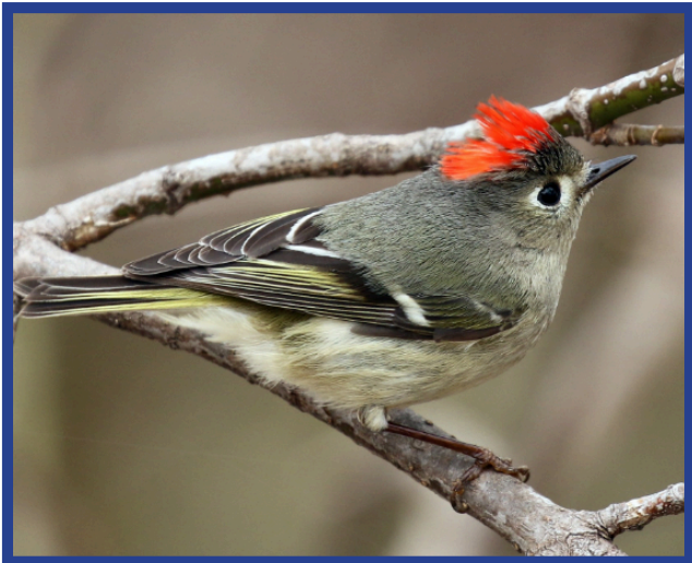
Ruby-Crowned Kinglet ( Corthylio calendula )