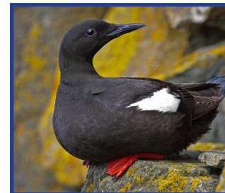
Black guillemot ( Cephus grylle )