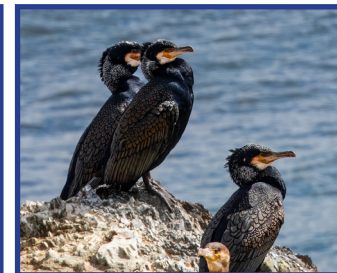
Double-crested cormorant ( Nannopterum auritum )