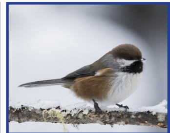
Boreal Chickadee ( Poecile hudsonicus )